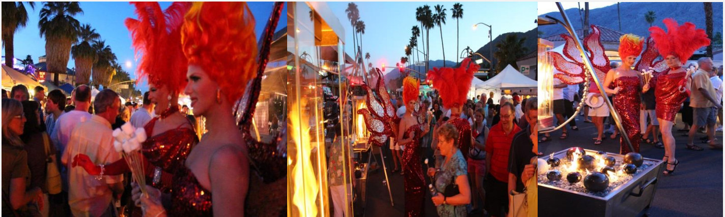
Roast Marshmallows Anyone?

More Moderustic Inc Fun... From Last Year's Halloween Extravaganza at the Village Festival in Palm Springs!